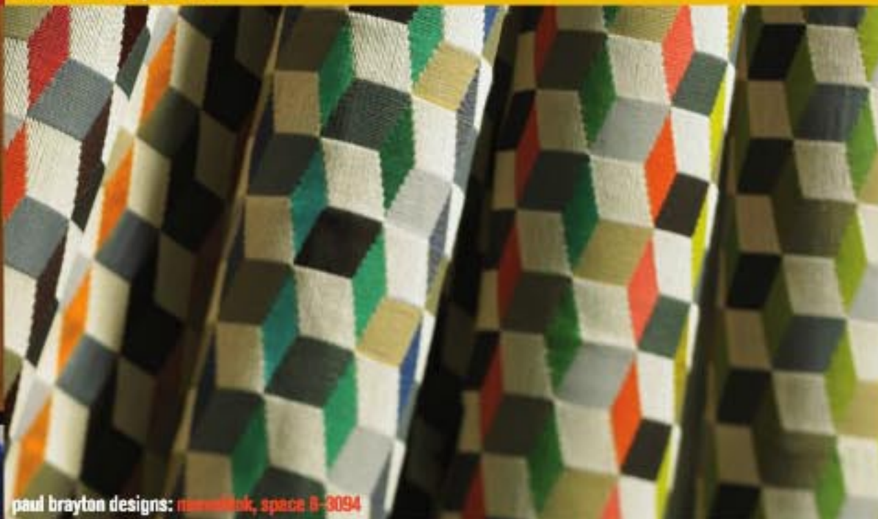
paul brayton designs: mosaiclink , space B-3094