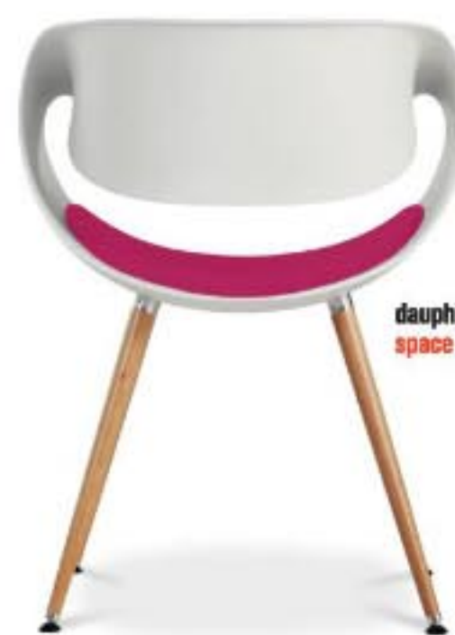
dauphin: little perillo , space 393