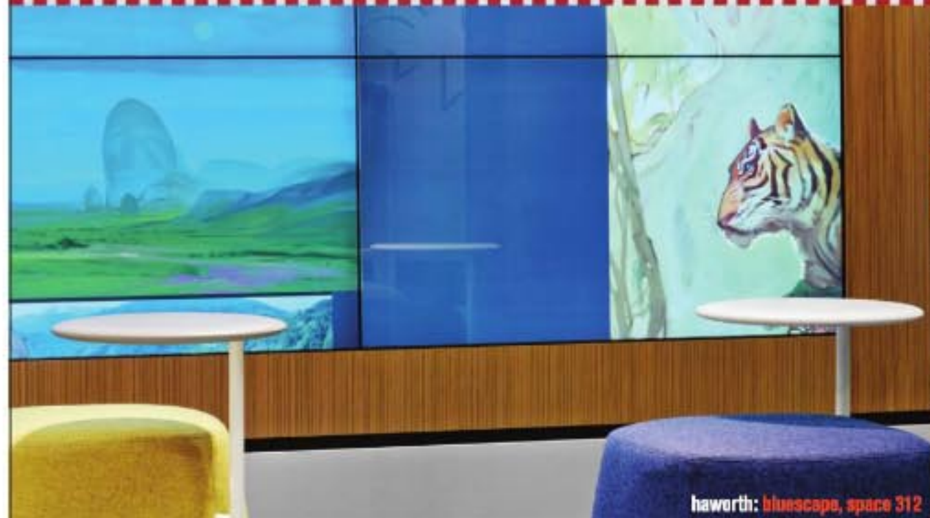
haworth: bluescape , space 312