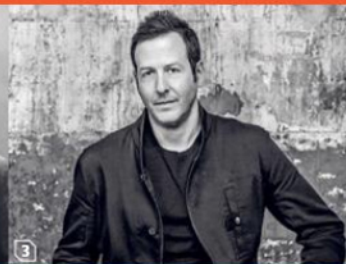
Brad Ascalon for Pablo Designs

product Belmont Table standout A raceway shade in premium wool felt (or woven fabric) tops the fully dimmable lamp's handcrafted oak or walnut base, which incorporates two USB ports. pablodesigns.com