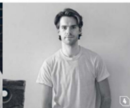
Colin King for Beni Rugs

product Ether. standout A repeat evoking the interplay of light on water distinguishes the Portland, Oregon, designer's handmade cement tile that comes in four colorways including Pink-and-Burgundy. thatcherstudio.com