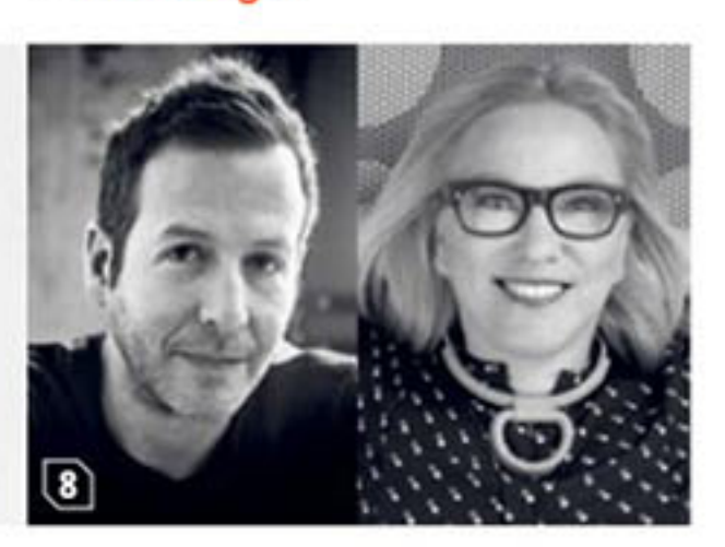
product Sunnyside. made in Duluth, Minnesota. standout The New York designers extraordinaire teamed up to envision a modular lounge set with water-repellant cushions atop a slatted base of postconsumer plastic. Iolidesigns.com >