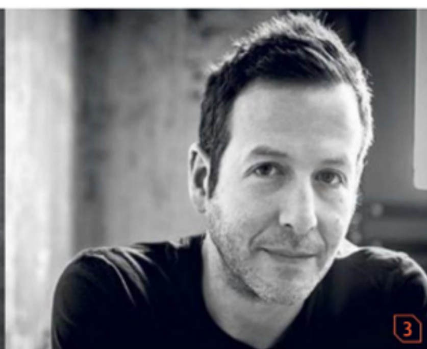
Brad Ascalon for Kateha

product Verbena recap A series of sketches in which the industrial designer examined visual hierarchy sparked a monochromatic flat-weave of New Zealand wool, whose pile rings overlap like a Venn diagram. kateha.se