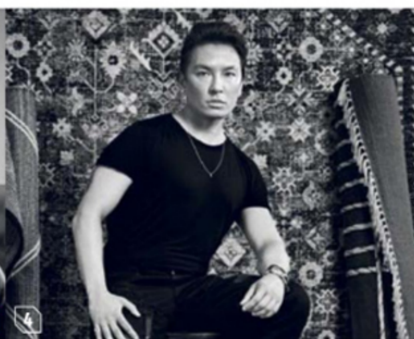
Prabal Gurung for Rugs USA

product SoHo recap The manufacturer's first collaboration with the Nepalese-American fashion designer includes 28 designs, among them this tassel-edged wool flatweave featuring cerebral line art in a tasteful hue that beckons pumpkin spice. rugsusa.com