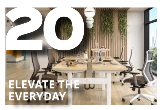
COVER STORY: SitOnIt Seating highlights the heightadjustable beauty of HiQ.