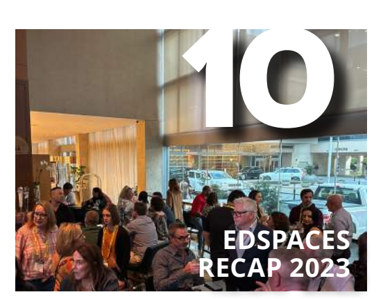
My Resource Library shares insights and highlights of EdSpaces 2023.